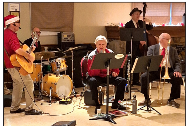
Thank you to the Steel Pier Jazz Band for performing at our BPI Holiday Celebration.