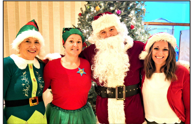
BPI "Santa" and his "Elves" showed up for BPI's Holiday party and passed out presents to all our Members.