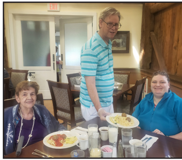
Delicious Healthy Meals