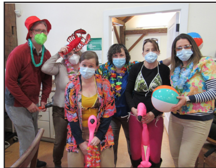
Celebrate "BPI Style"!

BPI can help you take better care of yourself and your loved one in the New Year!