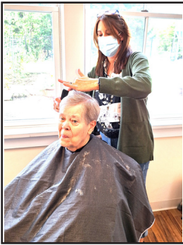
A Little Pampering